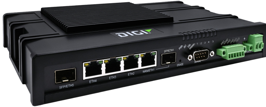
Digi IX40 – front