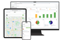
Manage and configure Digi IX40 with Digi Remote Manager